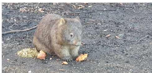
Baby Wombat enjoying some fresh food