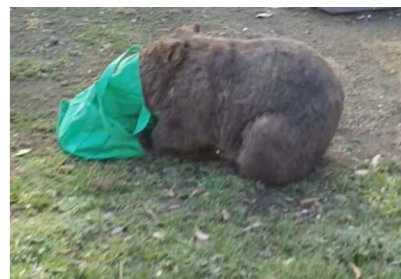
Too eager to wait!