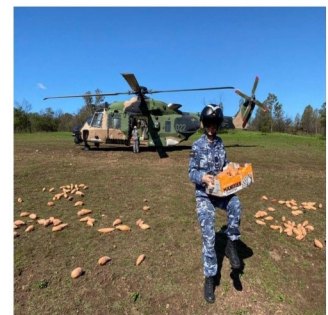
Navy air drop food from Wildlife Stations