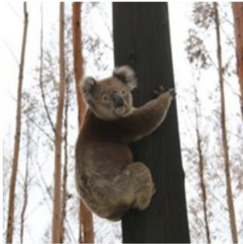
Kangaroo Island koala In burnt out habitat

Wildlife Stations wish to thank Figtree Heights Public School for assisting our efforts to feed hungry wildlife affected by bushfires.