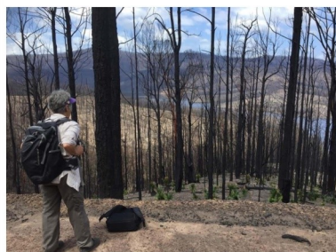
8 weeks after the fire