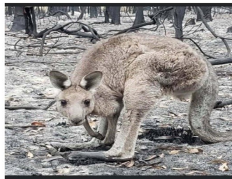
Wallaby in burnt bush