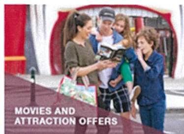
MOVIES AND ATTRACTION OFFERS

Many of you have already shown your support by purchasing a 2016 | 2017 Entertainment™ Book or Digital Membership. With over $20,000 worth of valuable offers, have you thought about buying a Membership for your Mum, other family members or friends?