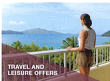
TRAVEL AND LEISURE OFFERS