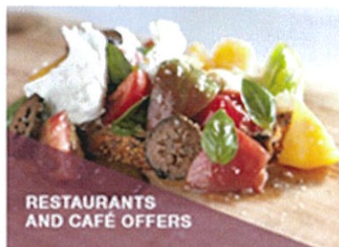
RESTAURANTS AND CAFÉ OFFERS

Support Figtree Heights Public School and have the perfect gift for Mum this Mother's Day.