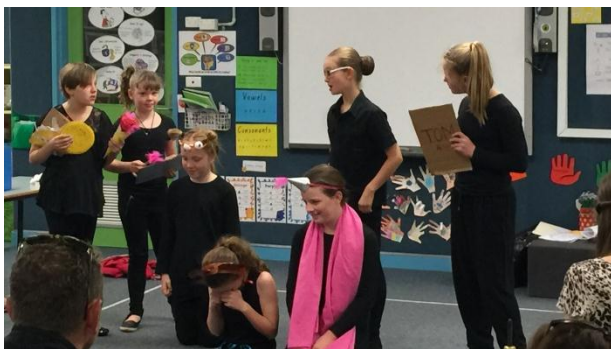
Language & Literature